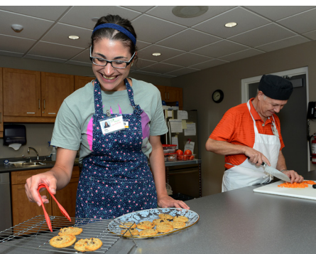
St. Joseph’s Hospice Volunteer Gardeners receive "Heroes In The Home" Award